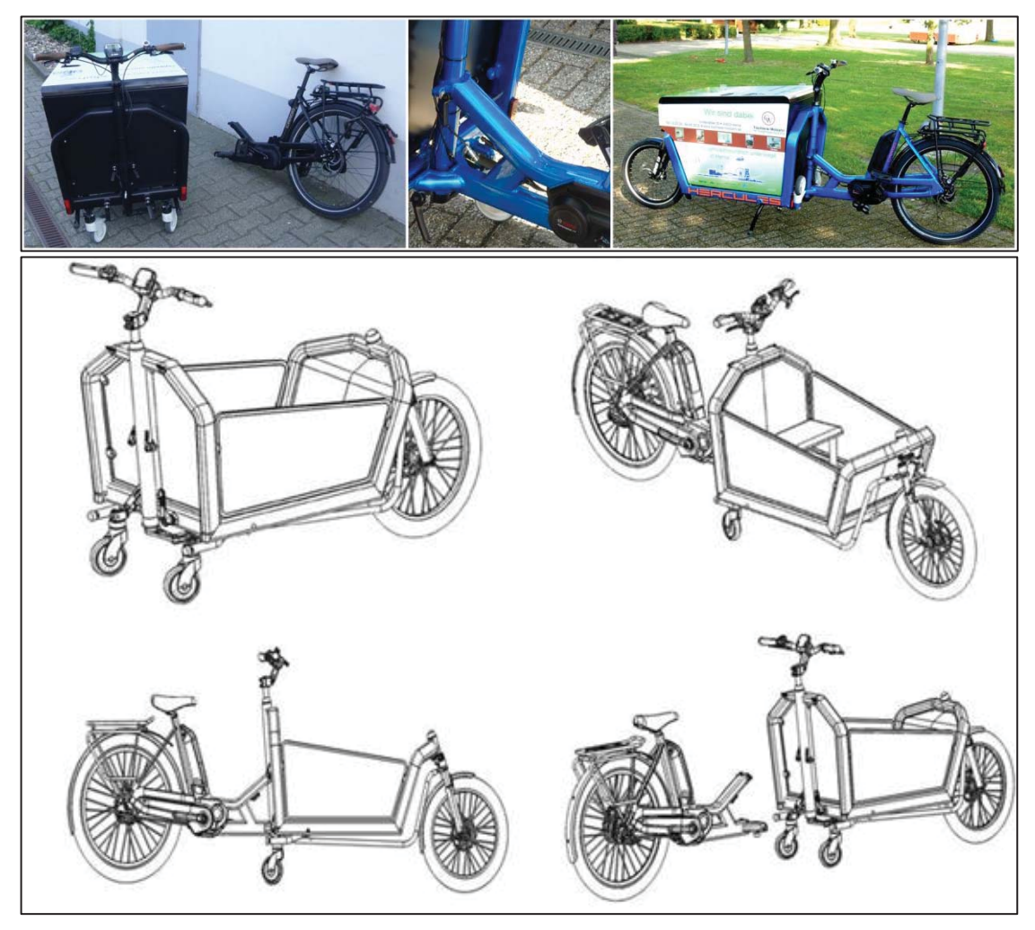
Figure 1: The Cargo Bike Prototype (own illustration, technical drawing: ZEG)

The prototype models "Hercules Cargo" used for the field test are a so-called "zero-series," which have been provided as test-fleet for trying out the drivability in general as well as with the intended payload, loading capacity, and stability to initiate adoption measures before the actual market introduction in the