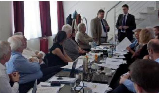
Council meeting in Budapest, 9 March 2012

AET Council has met on 2 December 2011 in the Hague, the Netherlands, as well as on 9 March in Budapest, Hungary and on 15 June in Karlsruhe, Germany following the respective AET Board meetings. AET Council special task forces have produced the new vision and relevant Action Plan for the Association and have also planned special events for the celebration of the 40 th anniversary of ETC, at ETC 2012, in Glasgow.