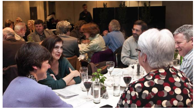
AET Board and Council members and friends having dinner at the Acropolis museum