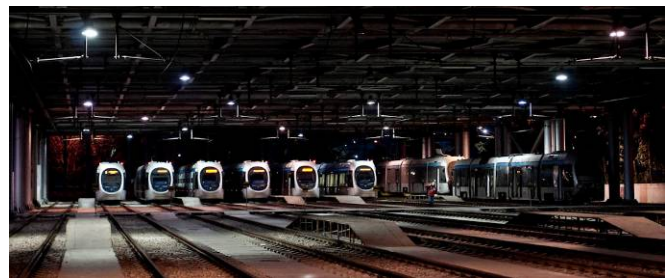
Technical visit to the Athens Tram Control Center (left) and Depot (right), on the 4 th of March 2011