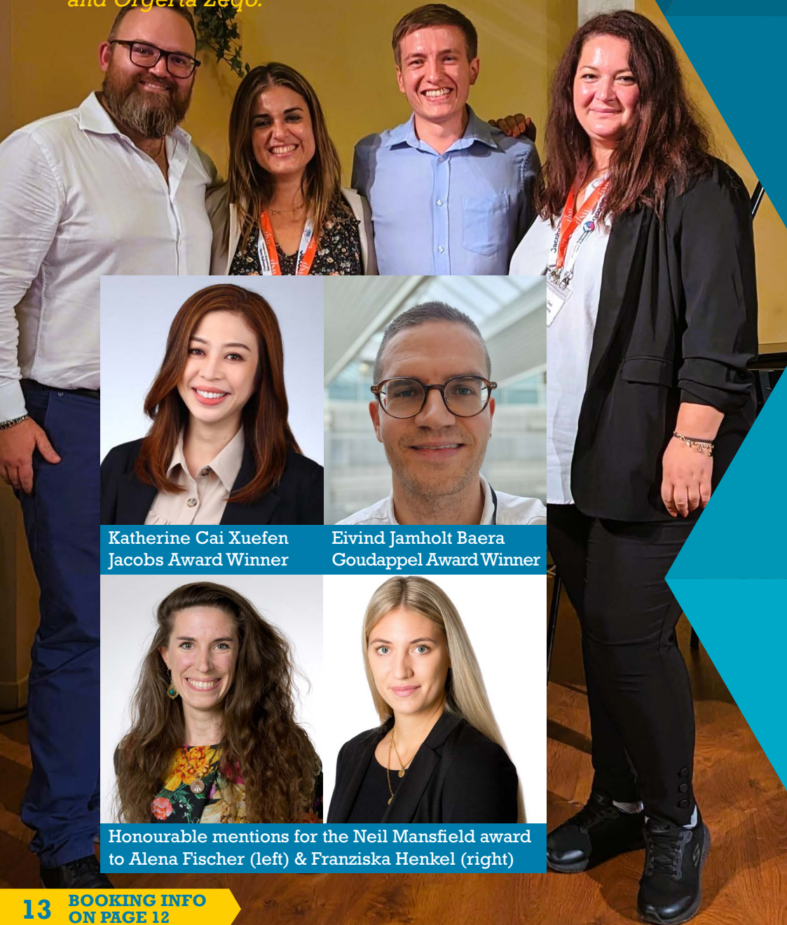
Katherine Cai Xuefen Jacobs Award Winner